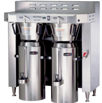
CBS-62H and TPD Dispenser (sold separately)