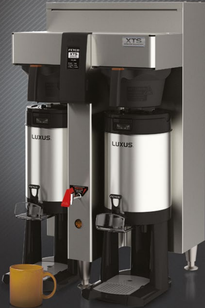
CBS-2152-2GXTS Twin Station Brewer*

* Shown with L4D-20 Luxus® Dispenser (sold separately)